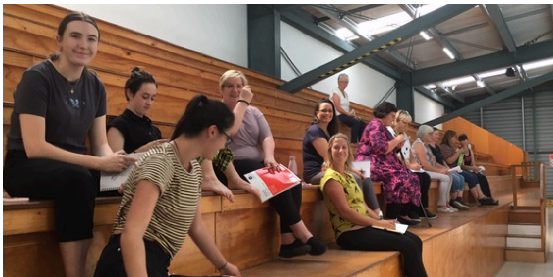
The practical component, testing the skills followed by classroom review.

The official's seminar in New Plymouth on 27 th and 28 th March was a full-on weekend of learning and testing of skills. Big thanks to all who made it happen – The Rollart Committee, the Artistic Committee and the skaters who participated. The sharing of knowledge by our International Officials and the willingness to learn shown by all participants made it a great weekend. We definitely need more keen people to upskill to become judges and eventually Technical Specialists. If you are interested in joining please email rollartnz@gmail.com . Take the first step, we need more people to put their hand up.